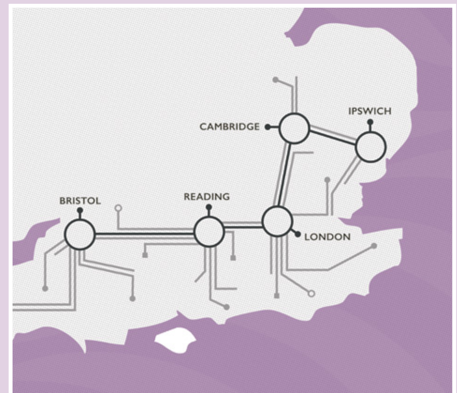
Schematic representation of the UKQN/UKQNetel

The UKQNetel network provides a test-bed for the integration of quantum-safe communications technologies – both QKD and quantum-resistant cryptography – within the conventional communications base. This is paving the way for integration within the wider national communications infrastructure, in order to ensure cybersecurity in the future quantum-enabled world.